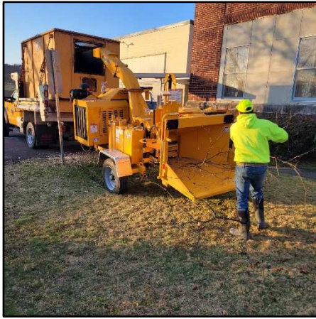
Township Street Department cleaning up the trees limbs/brush around the municipal building with shredder purchased with 902 Recycling Grant.

When putting out branches for brush collection program please take note in picture below of how to put them for the crew to pick them up.