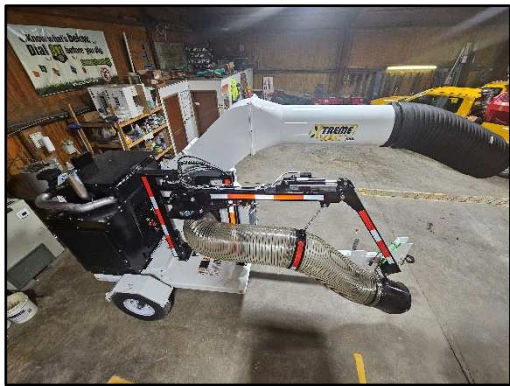
Debris/leaf collector purchased with 902 Recycling Grant.

If you would like this newsletter emailed to you in the future, please email your request to: dolson@ralphotownship.org